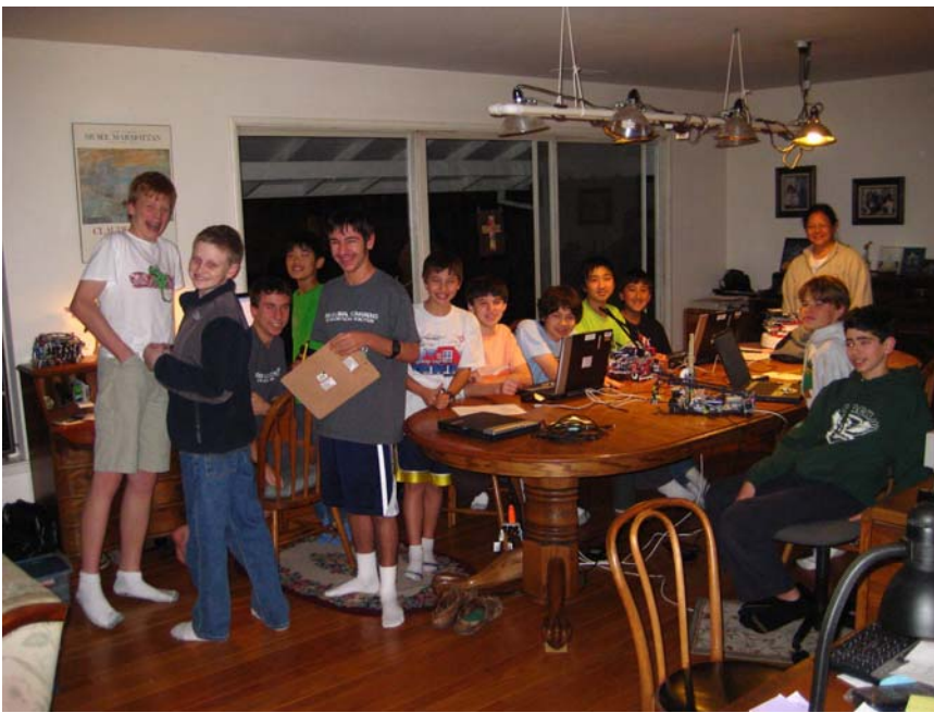
Botball preseason training meeting

reasonable team size is eight to ten students. The main organization is the KISS Institute for Practical Robotics (KIPR). It is a public charity under IRS code 501(c)(3). All contributions to KIPR for our team are tax deductible to the extent allowed by law and will defray the expenses for all the team members of the Los Altos Community Team. Since donations are tax deductible and fees are not, we encourage all parents to make a tax deductible donation in the $285 to $325 range to cover the team registration. After we have received all of the donations, each team member will be responsible for their part of the remaining cost. Anyone who drops out by January 31 will have their donation returned to them. Any extra funds raised this season will be saved for use for the next year's team(s) and/or helping team members attend the National Botball Competition. Botball qualifies for some company donation matching programs, so please consider this if one of these is available for you. Botball is not an educational institution so company donation matching programs that require the organization to be an educational institution will likely not work.