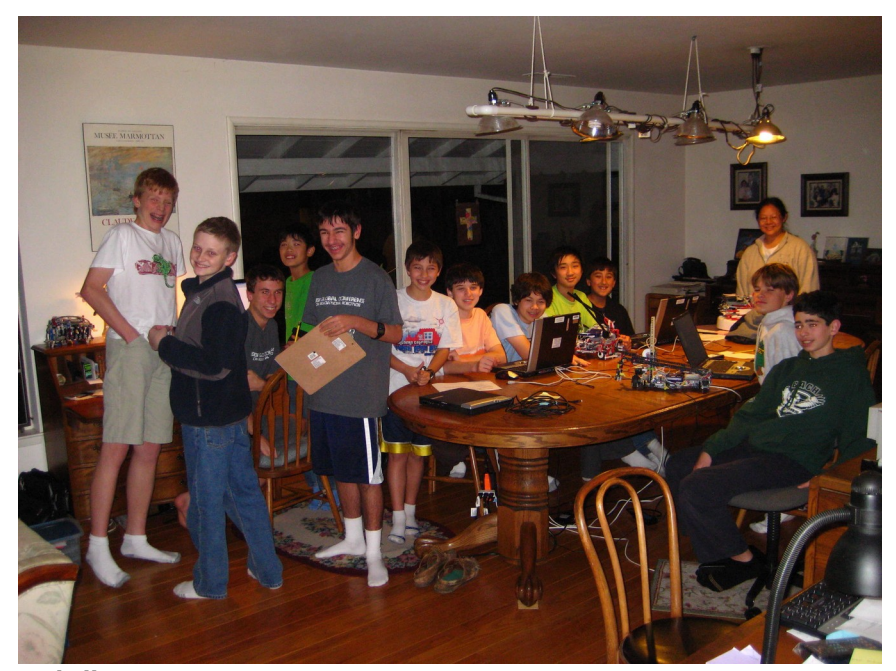
Botball preseason training meeting

students and the maximum reasonable team size is eight to ten students. The main organization is the KISS Institute for Practical Robotics (KIPR). It is a public charity under IRS code 501(c)(3). All contributions to KIPR for the teams are tax deductible to the extent allowed by law and will defray the expenses for all the team members of the Los Altos Community Teams. Since donations are tax deductible and fees are not, we encourage all parents to make a tax deductible donation in the $250 to $300 range to cover the team registration. After we have received all of the donations, each team member will be