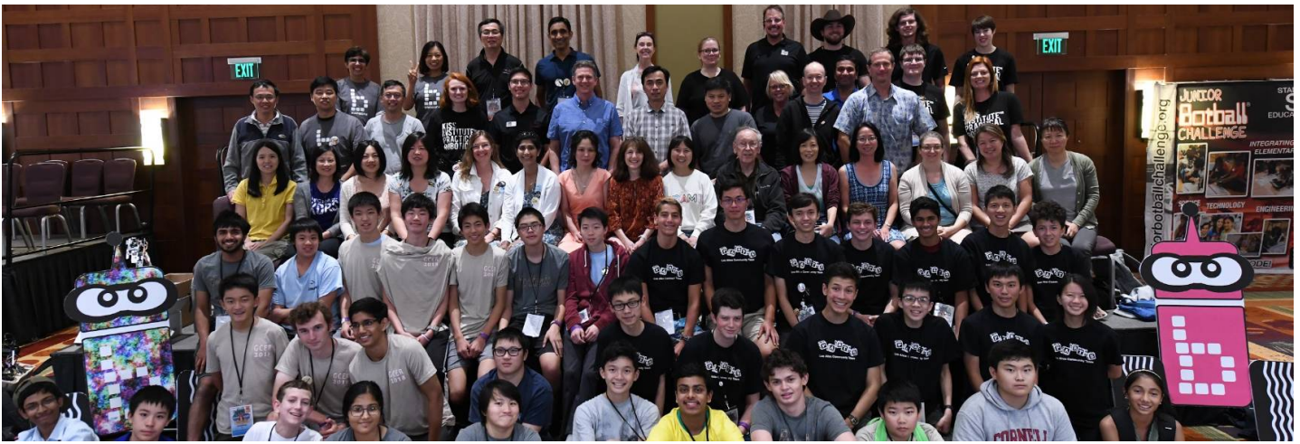
Los Altos Community Botball teams, coaches, parents, and Botball staff at the 2018 Global Conference on Educational Robotics (GCER) competition held in Indian Wells, California.