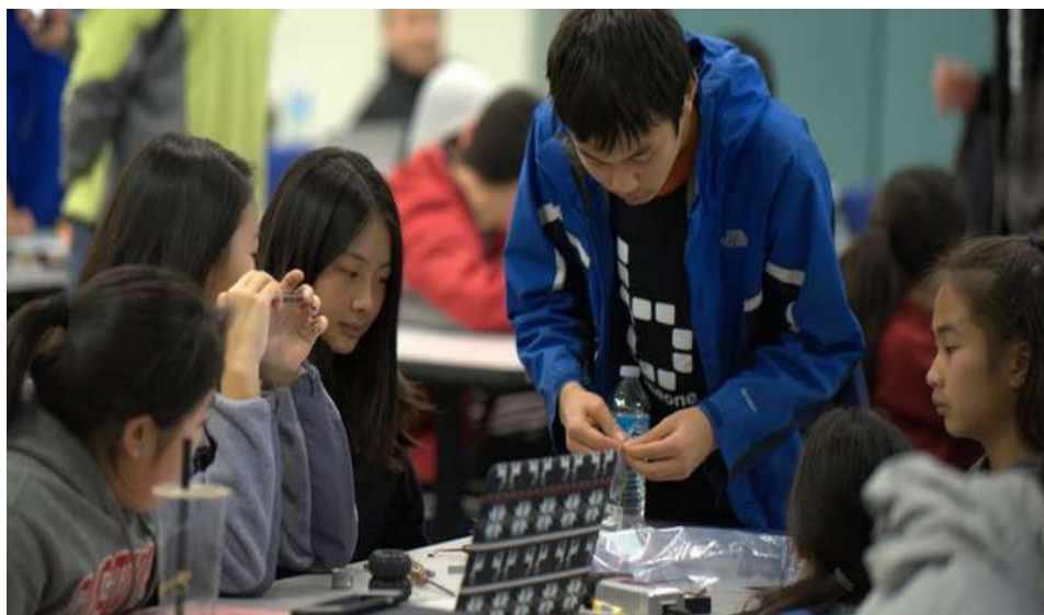
Botball preseason training meeting

We will be holding meetings before the competition is released to teach new members how to program and to bring returning members back up to speed. These meetings are important because we have found that once the challenge is released, most fundamental robotics learning stops and team members focus on building robots for the game. It is very important that all new team members attend all of the training meetings.