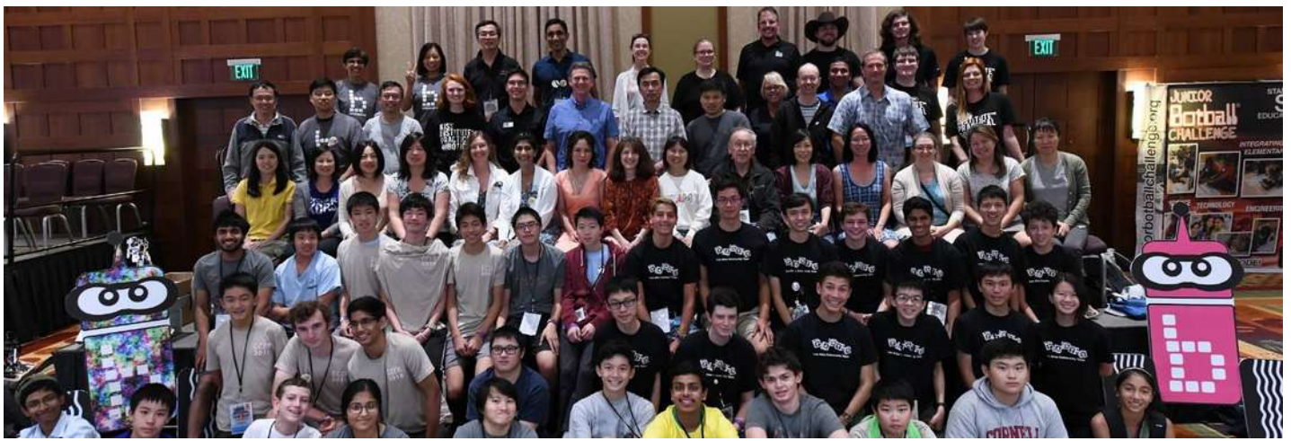
Los Altos Community Botball teams, coaches, parents, and Botball staff at the 2018 Global Conference on Educational Robotics (GCER) competition held in Indian Wells, California.