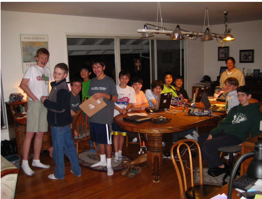
Botball preseason training meeting

students and the maximum reasonable team size is eight to ten students. The main organization is the KISS Institute for Practical Robotics (KIPR). It is a public charity under IRS code 501(c)(3). All contributions to KIPR for the teams are tax deductible to the extent allowed by law and will defray the expenses for all the team members of the Los Altos Community Teams. Since donations are tax deductible and fees are not, we encourage all parents to make a tax deductible donation in the $250 to $300 range to cover the team registration. After we have received all of the donations, each team member will be responsible for their part of the remaining cost. Anyone who drops out by January 27 will have their donation returned to them. Any extra funds raised this season will be saved for use for the next year's team(s) and/or helping team members attend the National Botball Competition. Botball qualifies for some company donation matching programs, so please consider this if one of these is available for you. Botball is not an educational institution so company donation matching programs that require the organization to be an educational institution will likely not work.