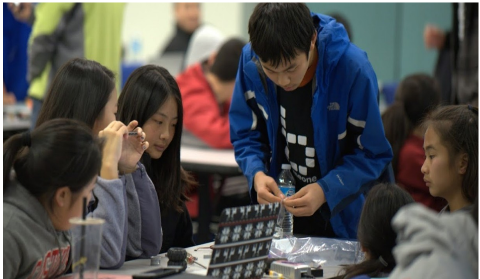
Botball preseason training meeting

We will be holding meetings before the competition is released to teach new members how to program and to bring returning members back up to speed. These meetings are important because we have found that once the challenge is released, most fundamental robotics learning stops and team members focus on building robots for the game. It is very important that new team members attend all of the training meetings.