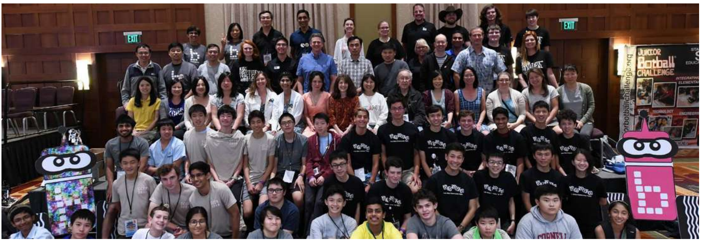
Los Altos Community Botball teams, coaches, parents, and Botball staff at the 2018 Global Conference on Educational Robotics (GCER) competition held in Indian Wells, California.