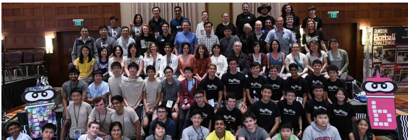
Los Altos Community Botball teams, coaches, parents, and Botball staff at the 2018 Global Conference on Educational Robotics (GCER) competition held in Indian Wells, California.