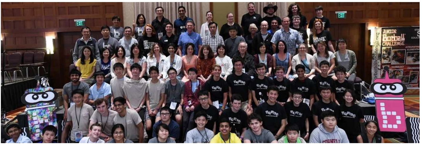
Los Altos Community Botball teams, coaches, parents, and Botball staff at the 2018 Global Conference on Educational Robotics (GCER) competition held in Indian Wells, California.