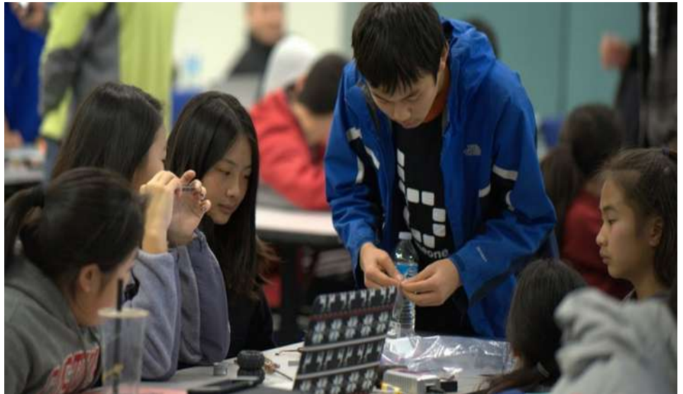
Botball preseason training meeting

We will be holding meetings before the competition is released to teach new members how to program and to bring returning members back up to speed. These meetings are important because we have found that once the challenge is released, most fundamental robotics learning stops and team members focus on building robots for the game. It is very important that all new team members attend all of the training meetings.