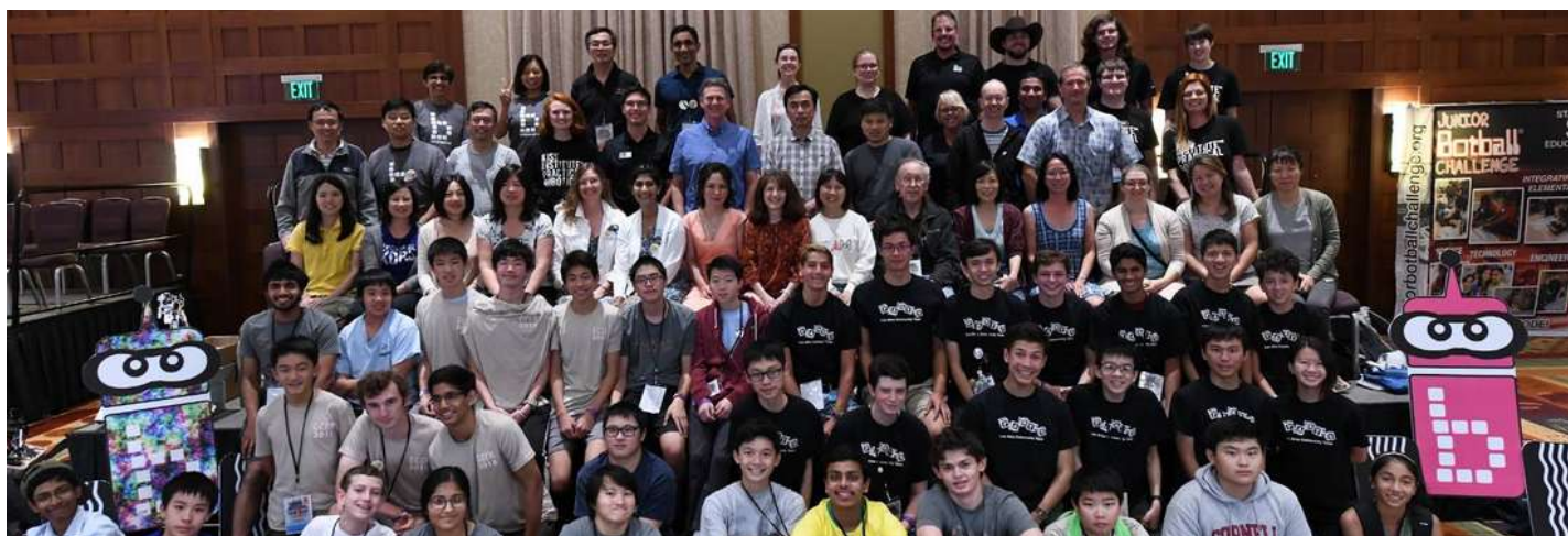
Los Altos Community Botball teams, coaches, parents, and Botball staff at the 2018 Global Conference on Educational Robotics (GCER) competition held in Indian Wells, California.